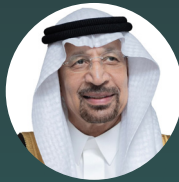
H.E. Khalid Al-Falih Minister of Investment Kingdom of Saudi Arabia