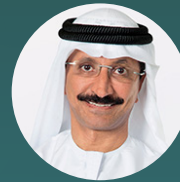
H.E. Sultan Ahmed Bin Sulayem Group Chairman & CEO DP World