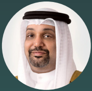
H.E. Shaikh Salman bin Khalifa Al Khalifa

Minister of Finance & National Economy Kingdom of Bahrain