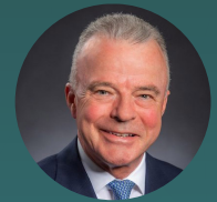
Brendan Nelson President Boeing Global