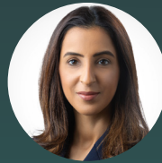
H.E. Noor bint Ali Alkhulaif Minister of Sustainable Development, Chief Executive of Bahrain EDB Kingdom of Bahrain