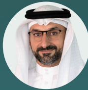
H.E. Abdulla bin Adel Fakhro Minister of Industry & Commerce Kingdom of Bahrain