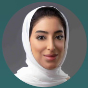
H.E. Fatima Al Sairafi Minister of Tourism Kingdom of Bahrain