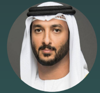
H.E. Abdullah bin Touq Al Marri Cabinet Member & Minister of Economy United Arab Emirates