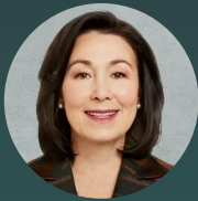
Safra Catz CEO Oracle

Minister of Finance & National Economy Kingdom of Bahrain